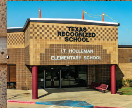
Holleman Elementary School