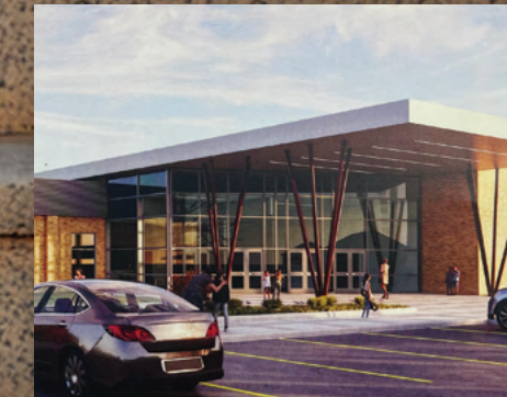
Waller Junior High School