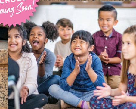
Future Onsite Elementary School