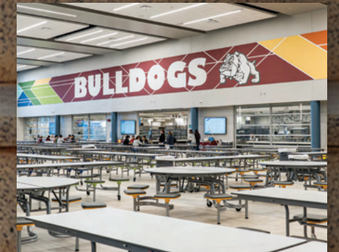
Waller High School